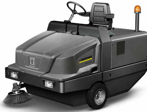
KM 130/300 R Bp / KM 130/300 R Bp 2SB