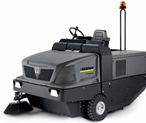
KM 150/500 R Bp / KM 150/500 R Bp 2SB